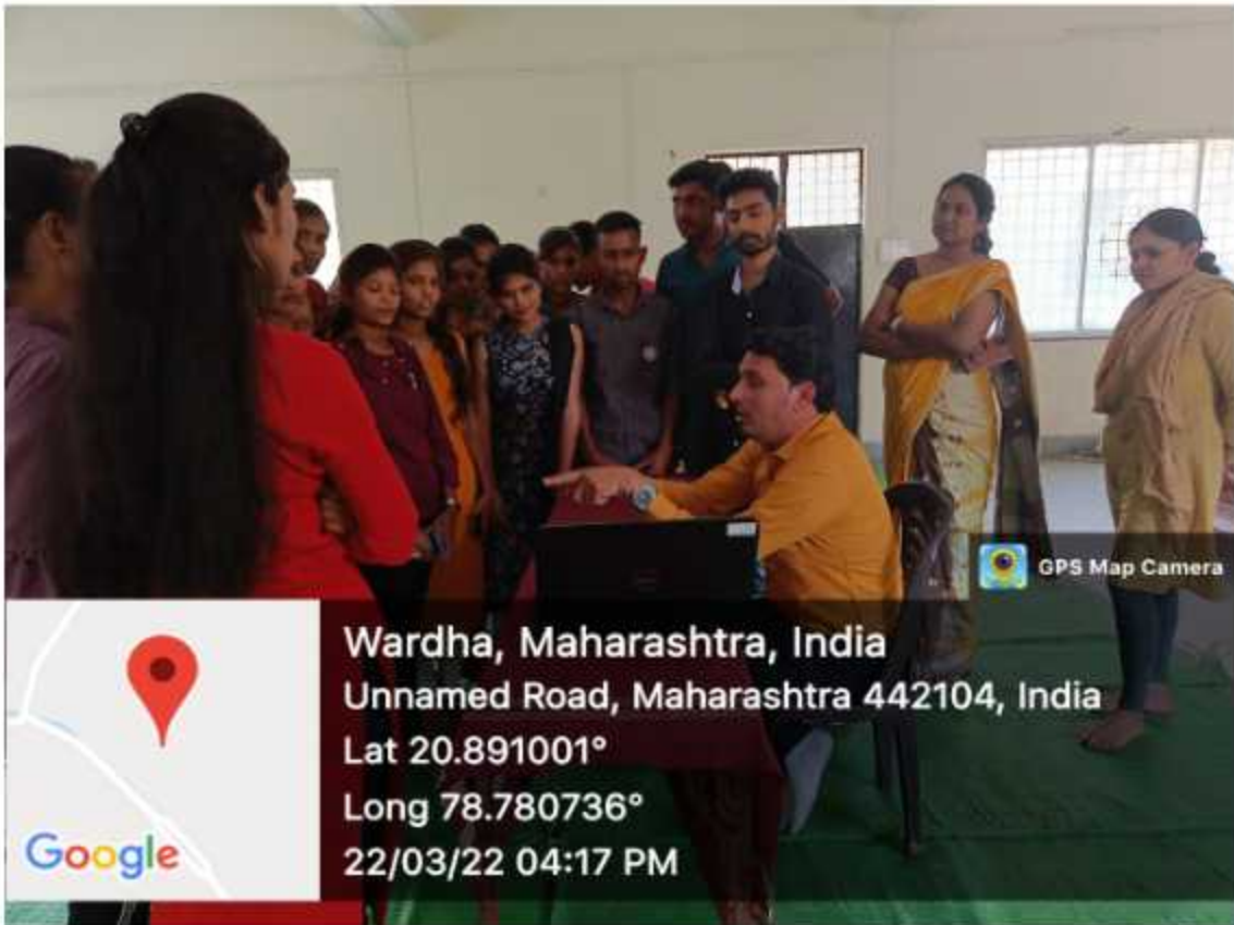
During NSS camp students participated in Azola cultivation training program