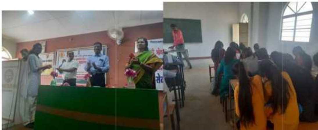
Students participated in essay competition on Leprosy and tuberculosis disease