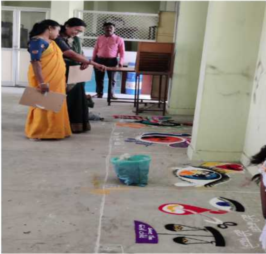
Students participated in Rangoli Competition during NSS camp of session 2021-22