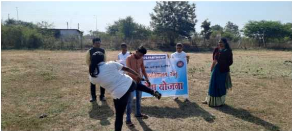
Students participated in Self defence training program under the Azadi ka Amrut Mahatsav during the session 2021-22