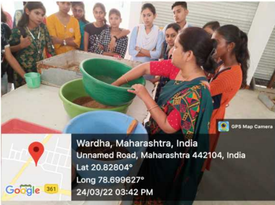
Students participated in Black soldier fly organic waste management training program