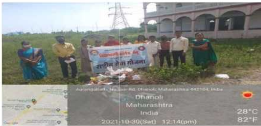
Students actively participated in plastic free college campus drive under the Clean India Campaign