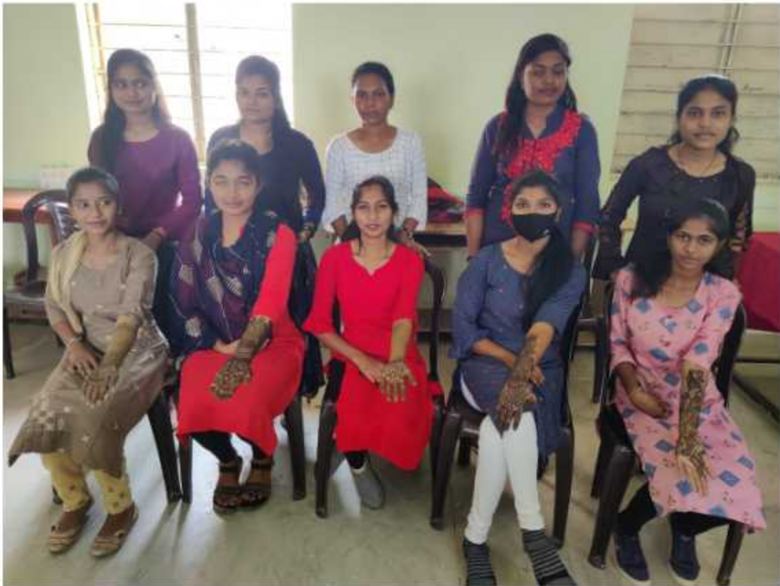
Students participated in Mehandi Competition held on 28 th March 2022 during NSS camp