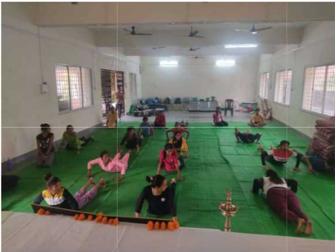
Students participated in Yoga activity held during this session 2021-22