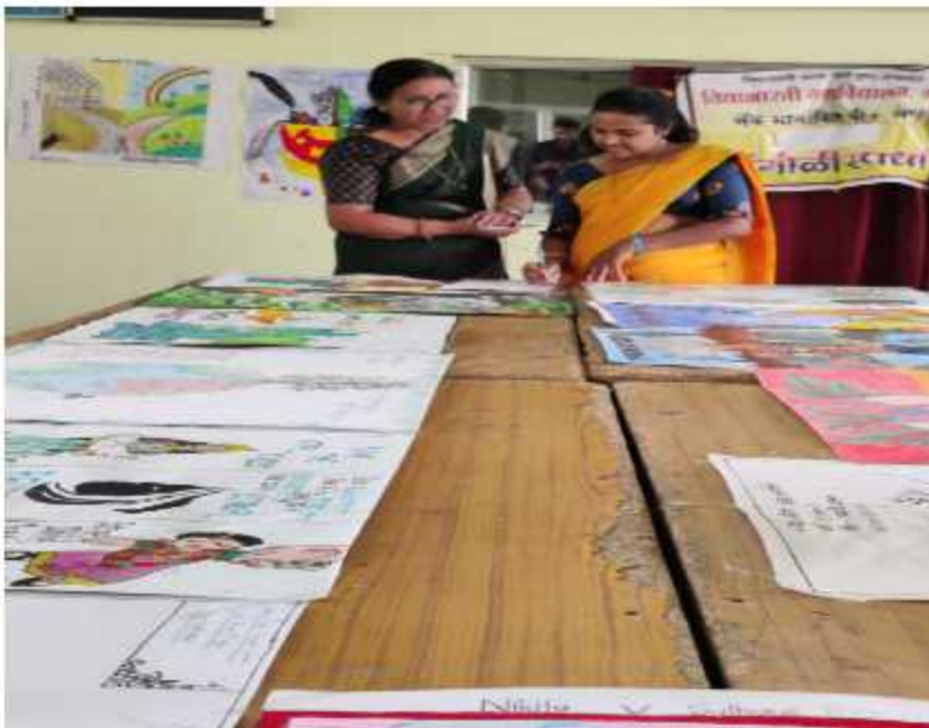
Students participated in drawing competition during NSS camp of session 2021-22