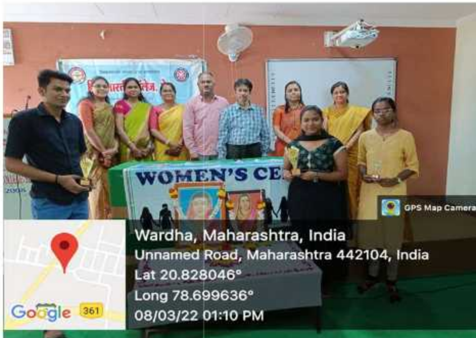
Winners of the "Best Speech Competition"