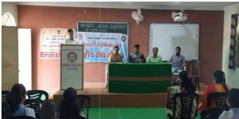
Students participated in workshop on Neurological and Mental Health with District Recognized Hospital, Wardha